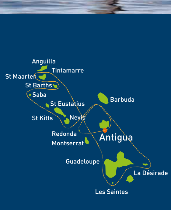
Figure 1 – The Course